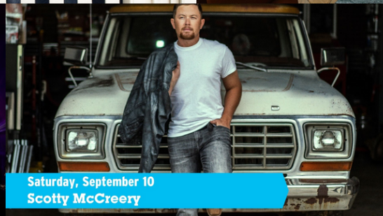
Saturday, September 10 Scotty McCreery