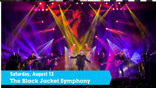
Saturday, August 13 The Black Jacket Symphony